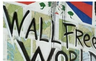
Society and Change