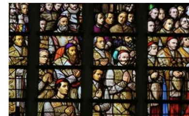
Theology and Religious Studies