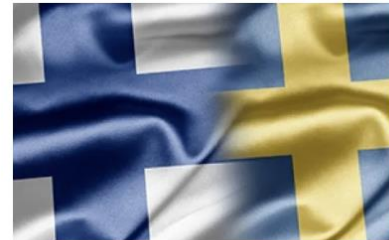
Languages and Literatures of Finland